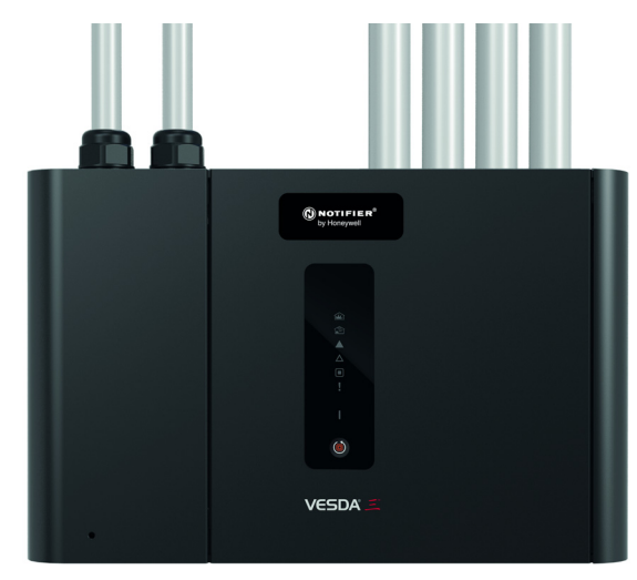
Intelligent VESDA-E VEP-A10-P-NTF

The Intelligent VESDA-E VEP Series is compatible with existing VESDA installations. The detector occupies the same mounting footprint, pipe, conduit and electrical connector positioning as VESDA VLP.